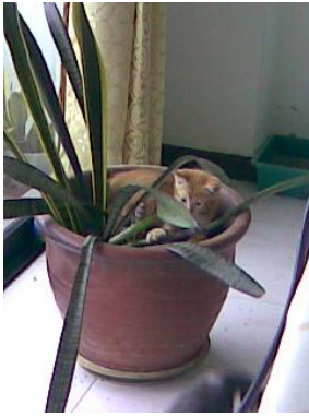
BammBamm fights the giant plant

At about six weeks old, their first day home, the kittens looked a bit scruffy and bewildered, but quickly settled down into a sheepskin and drifted off to sleep. They grew amazingly quickly in the succeeding months – and these clowns became a constant source of entertainment. You can't help but laugh at their antics-- bounding up on sofas and across tables, skittering across the tile floors in pursuit of balls and string. One litter but three very different kittens: one has the softest white fur on belly and legs and salt-and-pepper dark patches above. She jumped into the arms of a visiting friend who intuitively spoke her name, "Pebbles." Her patterns reminded him of pebbles on a beach. Naturally, her brother who is a perfect miniature yellow lion