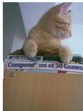
Can we play now?