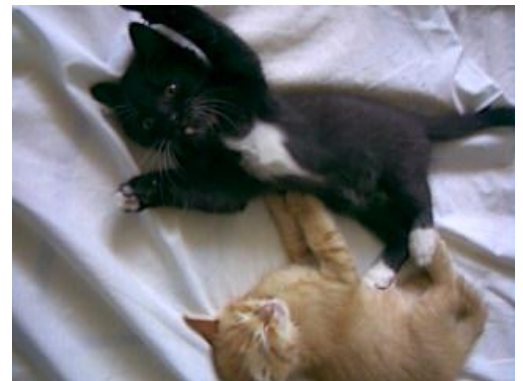
Lucky in his tuxedo and baby lion BammBamm

The third kitten is dressed in a tuxedo – mostly black with white socks and a star on his chest. A bit of a loner, he was delighted when my daily swim-and-chat partner fell in love and took him home to her apartment. There he has become "king of the house" and sits atop the piano or stares at the strings of the guitar as her musician husband plays. He is a very lucky little fellow to have such a devoted family, hence his new name, "Lucky." Like me, my friends are infatuated with this little troupe of Malaysian cats who seem to be exceptionally smart and communicative felines. They learned quickly that they should not run out the front door, that the laundry room porch was off-limits, that they should use the litter box and not the floor. Lucky, under my friend's instructions, has even learned to use the toilet!