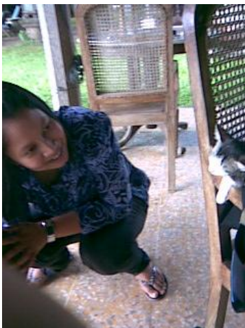
Bon Ton staff chatted with the kittens in the restaurant while the cat parents drank coffee.

After the trauma of the kittens’ first visit to the clinic for vaccinations, we humans needed a coffee so we went to the restaurant afterwards. We placed the three kittens on a chair where they stayed patiently for a full hour as we chatted. Waiters and waitresses came by to talk to the little cats.