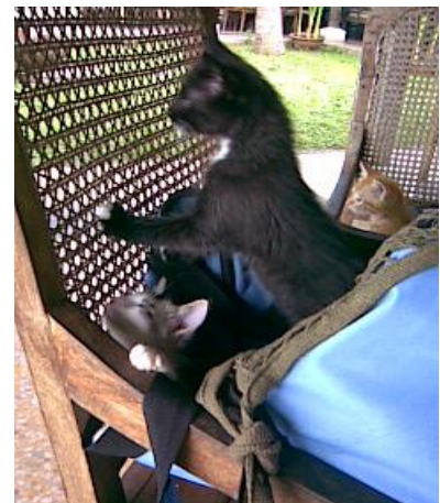
Lucky, Pebbles, and BammBamm sat patiently in a chair for an hour at Bon Ton restaurant. They watched the other animal residents cautiously.

To mark the occasion, the restaurant gave us the coffee for free. Cats and people were completely charmed.