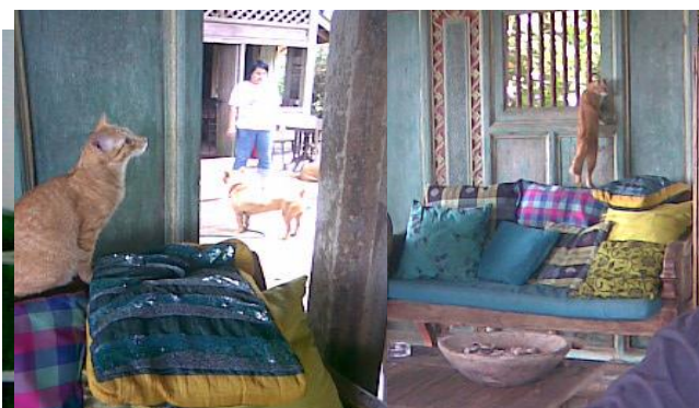
BammBamm sees his first dog in the restaurant at Bon Ton. Little did he know he would be in a cage at the clinic the following week.