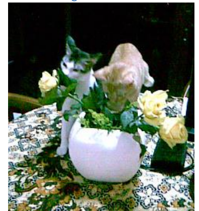
Roses are not usually on the menu

Looking after your local pack of wild dogs or herd of cats also would mean ensuring that none starve. Starving animals are far more dangerous to humans than those that are well-fed and healthy. When animals become sick, they can be taken to the clinic for care. Unlike so many places that destroy unwanted animals, the clinic practices a no-euthanasia policy and gives the animals as good care as they can until a better situation can be found for them.