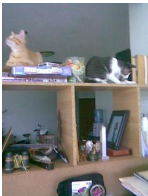
Where are the kittens now? High atop the bookcase!

My two have not yet accepted that they cannot run across the computer keyboard or lie out luxuriously on the dining table – but they know. They also know how to demand food – waking me in the morning with delicate nips on my toes and increasingly frantic meowing. Hunger pains come on five or six times during the day and they come cuddle in my lap, look up with big eyes, then jump up on the back of the couch, race across the room and settle in front of the refrigerator to wait for me to give them another bit of canned fish or boiled chicken. Between meals, they are endlessly inventing new games – bounding, stalking, wrestling with each other or with plants. They climb curtains, jump across the tops of wardrobes, bounce off the walls, jump into the air to try to reach geckos on the ceiling high above (impossibility), then throw themselves down on the clean sheets, towels, pillows exhausted to nap. They are hilarious – I have not laughed so much in years.