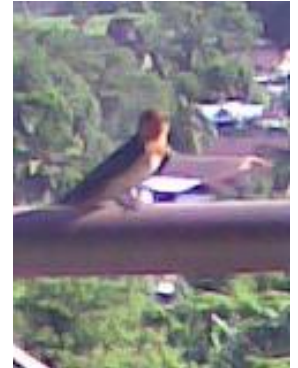
1 Wildlife, esp. birds are endangered by the growing populations of stray cats and dogs